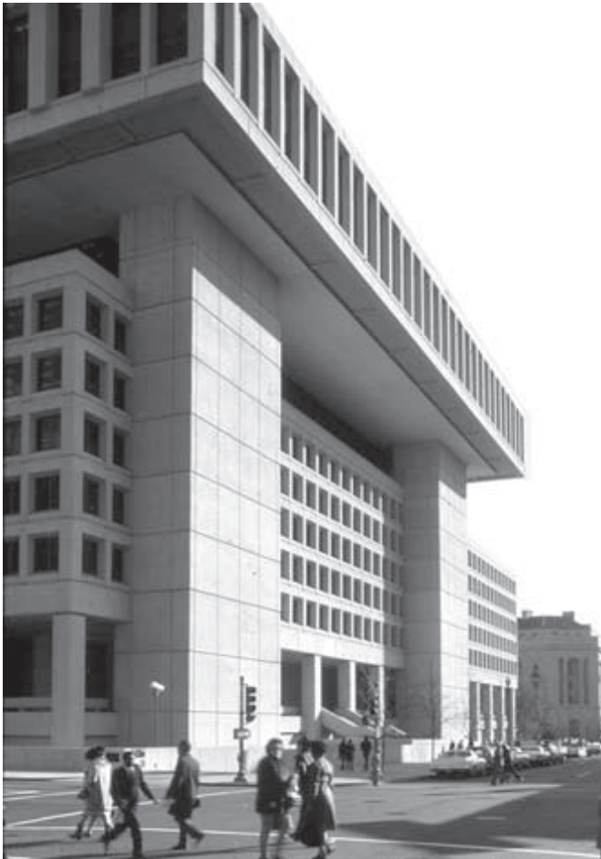
J. Edgar Hoover F.B.I. Building, Washington, DC